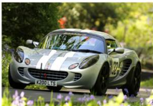
Jon Langmead's Lotus Elise

With all drivers and riders completing four timed runs - one practice and three event runs - it