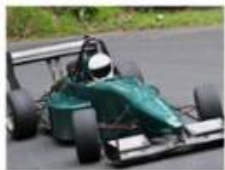
Andrew Forsyth - OMS CF04.

This was the first meeting after the whole 1000 yard course was recently resurfaced and, after cautious runs in practice on Saturday, the verdict from the competitors was that the new race track specification surface was a winner.