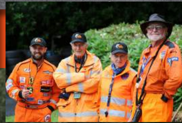
Marshals on The Gate