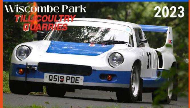
Sixth place - 99.68 pts