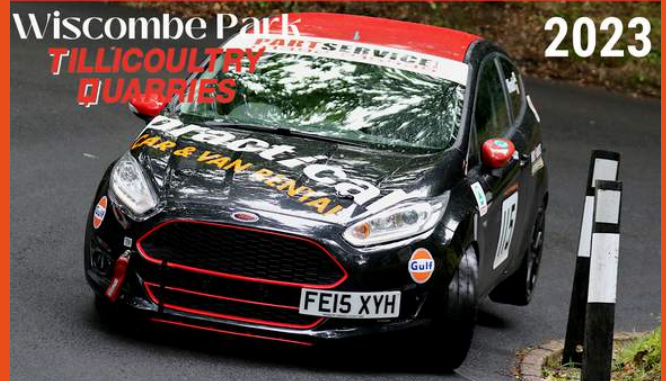
Fourth place - 104.27 pts