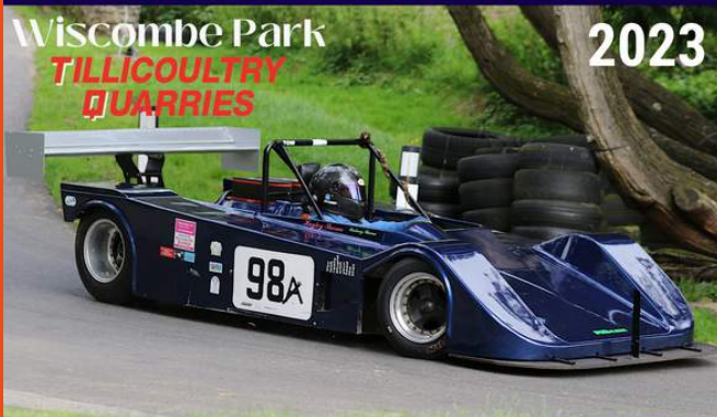
Fifth place - 99.84 pts