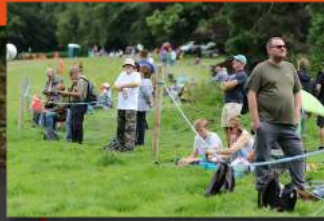
Spectators line Wis Straight