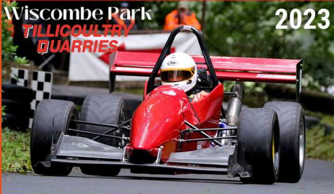
Third place - 104.38 pts