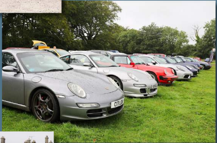
The Independent Porsche Owners Club British Championship - July