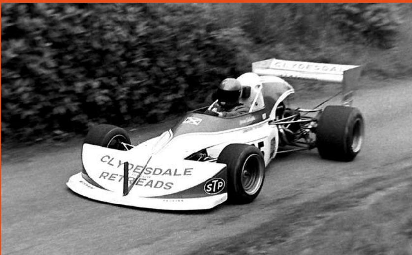
March 742-772 - Fintray August 1979