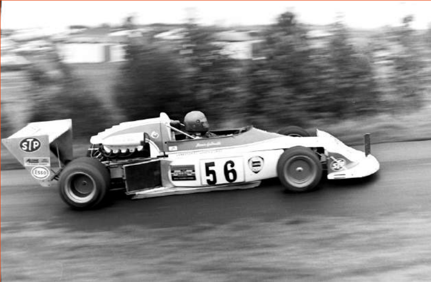
March 742-772 - Kinkell Braes October 1979