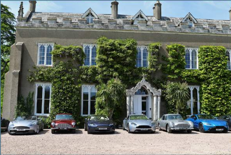
Aston Martin Owners Club Vintage Sports-Car Club - May