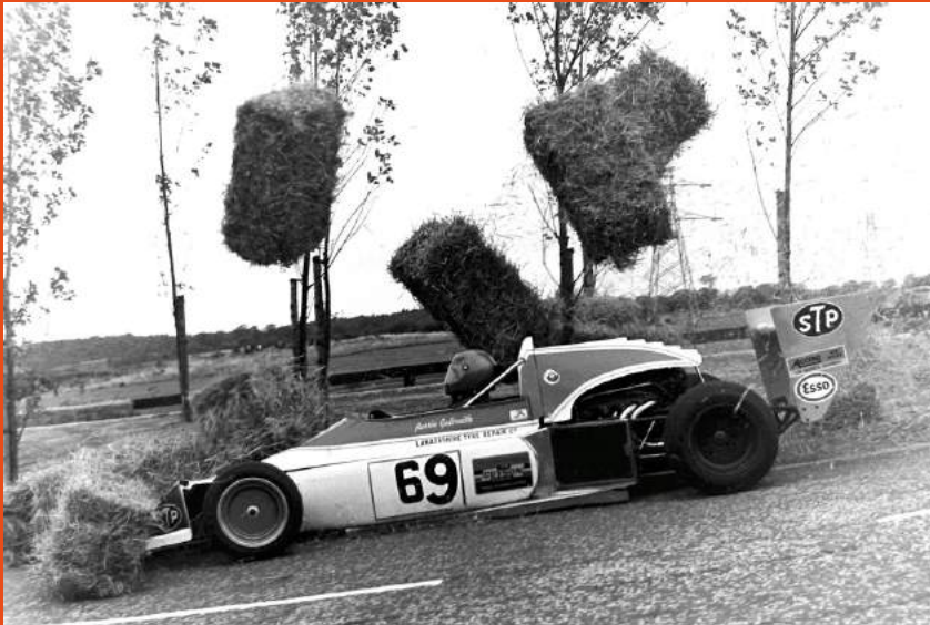
March 742-772 - Strathclyde Park Sept 1979